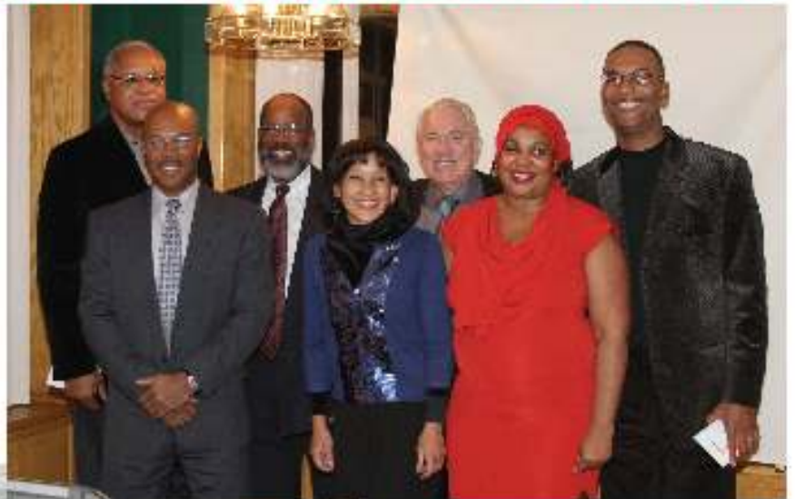
AVSC Executive Board