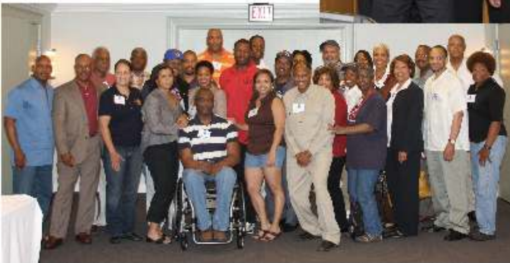
2009 NABS President's Meeting - Washington, D.C.